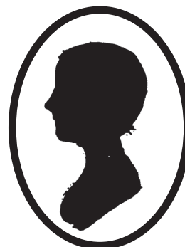
Silhouettes of some of the Haines children